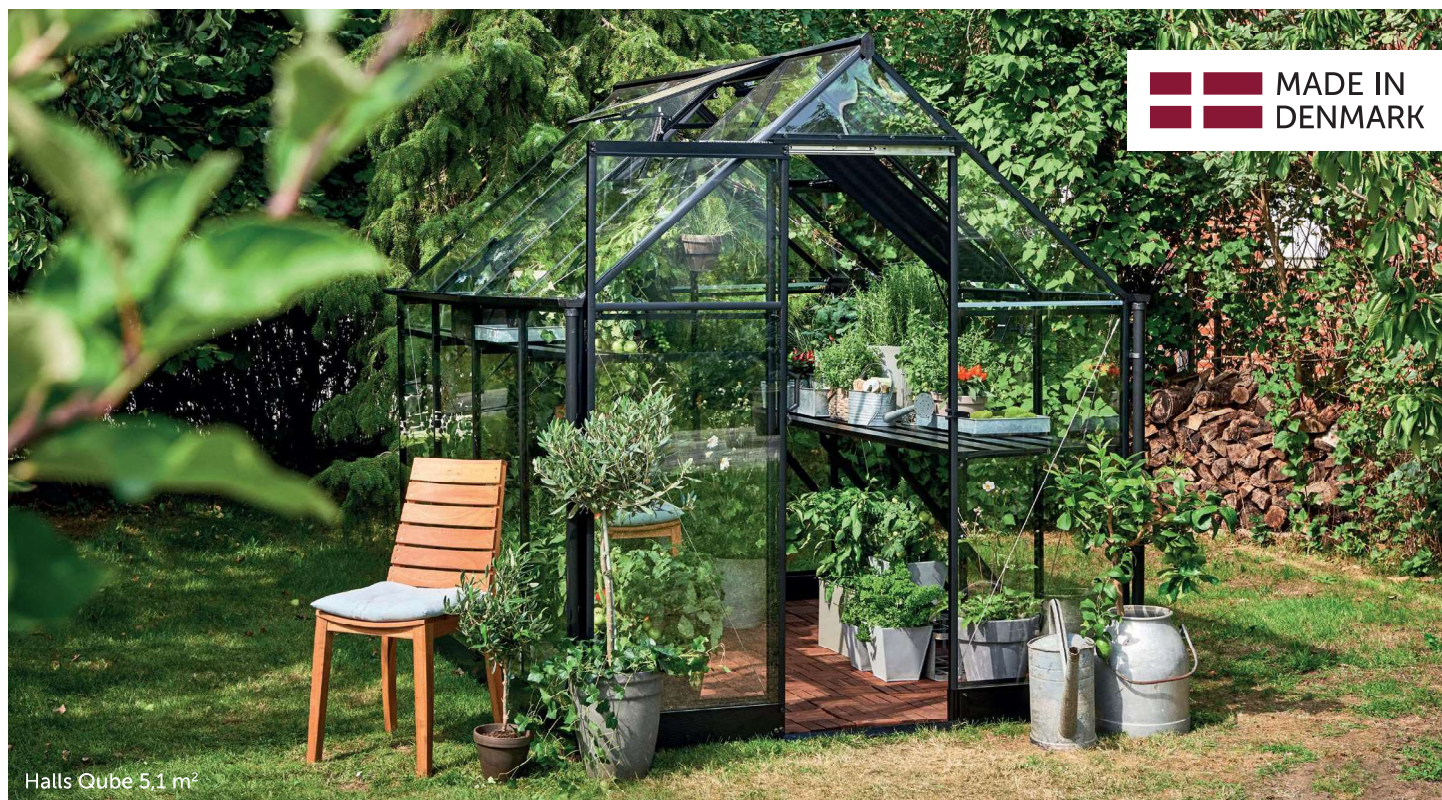
Halls Qube 5,1 m²