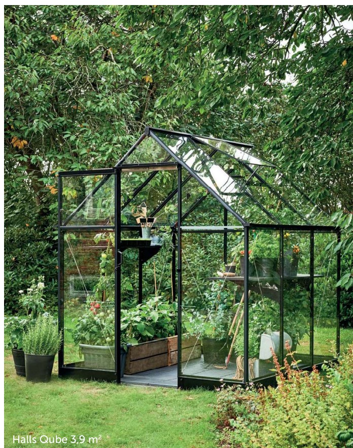
Halls Qube 3,9 m²